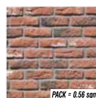
LOFT BRICK - BRICK