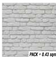
CITY BRICK OFFWHITE